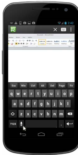
Figure 2 - Android