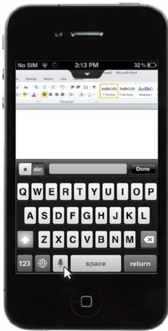
Figure 1 - iPhone

See that microphone key on the GoToMyPC mobile app keyboard? It means you can talk into your mobile device instead of typing, and your words will be sent as text to your host computer.