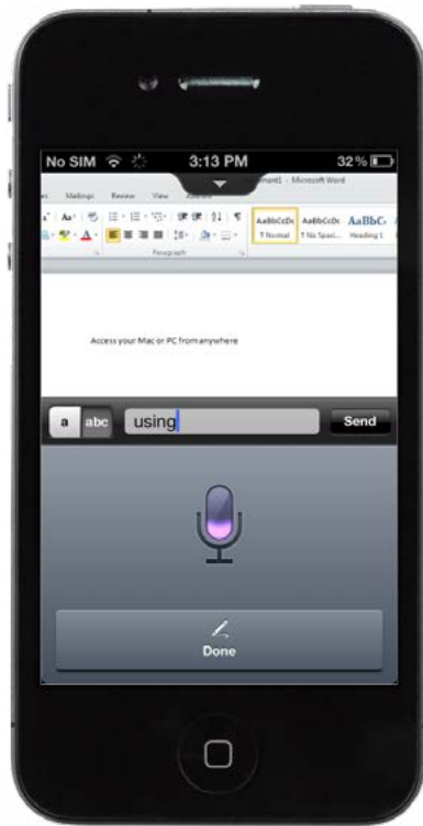
Figure 3 - iPhone