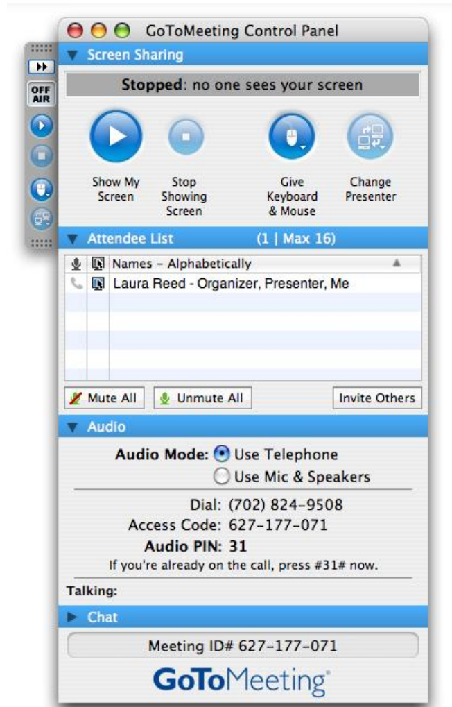
Figure 3: Presenter controls provide an easy way to manage the meeting while in session.

When the organizer begins a meeting as the presenter, he/she has a variety of controls allowing him/her to share his/her screen, view and manage attendees, chat with attendees, access and control integrated phone and VoIP audio conferencing, and invite other attendees once the meeting has started. A privacy shield prevents attendees from viewing the presenter's controls, which may contain sensitive information such as private chat text.