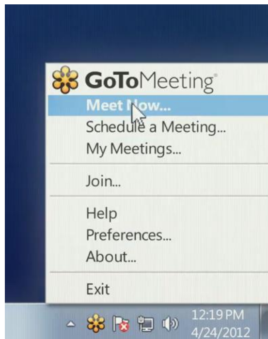
Figure 1: Click the Meet Now button after right-clicking the GoToMeeting icon.