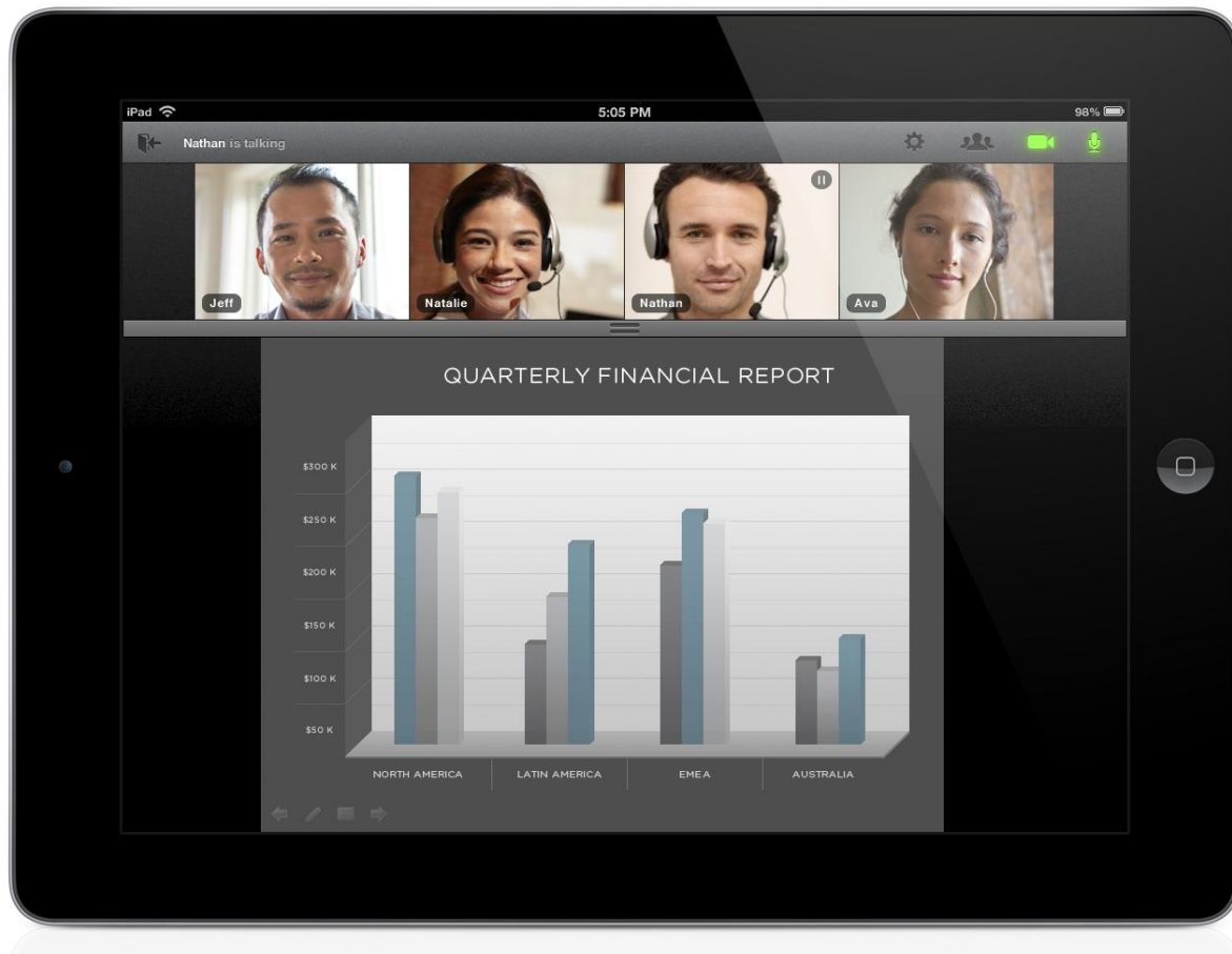
Figure 6: Enjoy full integrated video, screen sharing and audio on an iPad.